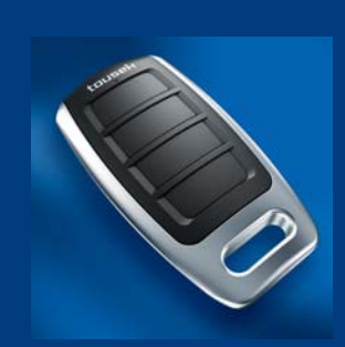
tousek impulse emitter programmes compatible and secure