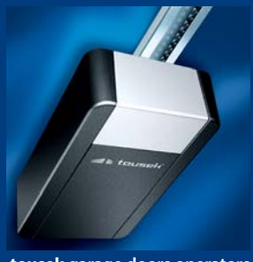
tousek garage doors operators convenient and safe