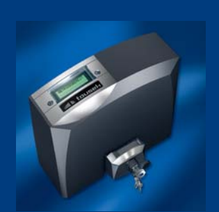
tousek sliding-gate operators compact and safe